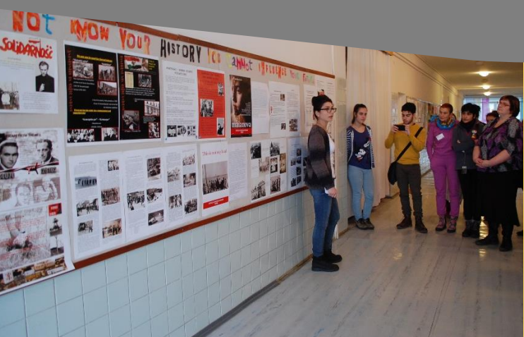
Exhibition of posters on violence