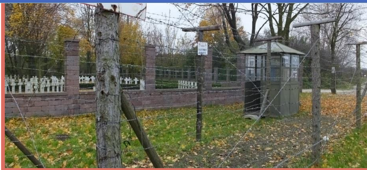
Exhibit of the Iron Curtain between former Czechoslovakia and Austria