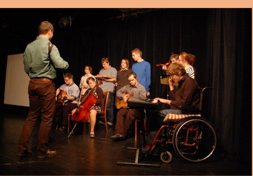
Concert of students of PaSA and mentally disabled students