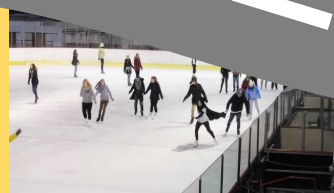
Fun on ice