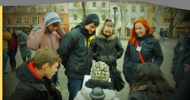
Ice-breaking activities in Bratislava